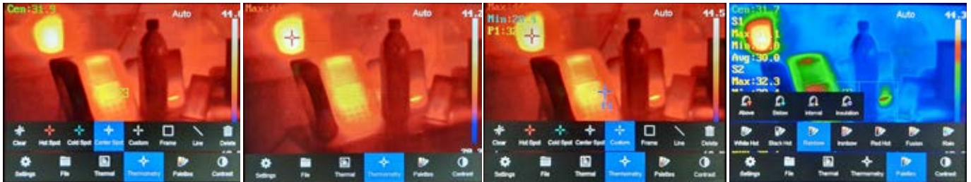
Standard display (center temperature)